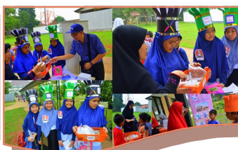
AN NAHL Market Day 2016