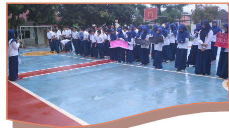
OSIS Candidate Leader Campaign, February 2016