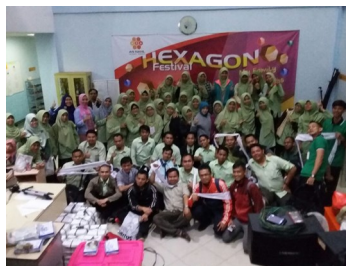
Foto session after measuring the length Fabric to break MURI Record (Foto Doc beebulletin 2016 )

day before the breaking of MURI Record time delivered his interesting 'tauziah' he said that "the good education can be achieved if it is got from inside not from outside of the human itself .it looks like The eggs hatch from inside is better than from outside , it means the children grow naturally, a school and teachers are just facilitator whereas the parents have the important role to educate their children, he said also, just let the children try to be more independent, learn how to solve the problem by themselves, by doing so the children