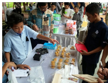
Selling the products in Market Day, (Foto, Doc.BeeBulletin.2016)

tion, how to make it, to manage the financial until the marketing, all the students look enthusiastic and enjoy this event, we could see from their expression when they offered their products to the visitor.