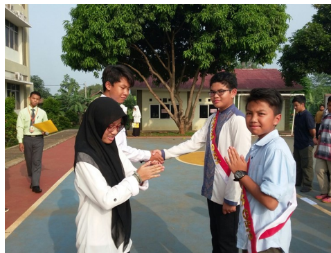
Handover of position from the old periode to the new periode