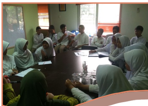
MPK meeting to decide the Osis Leader new periode 2016/2017