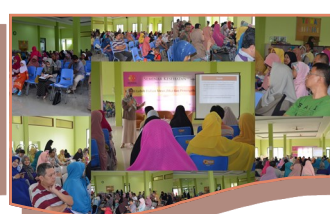
"Knowing About Virus Zika & How to avoid it " Seminar Feb '16