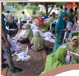
To Tangle the fabric in Breaking the MURI Record, January 30th 2016,