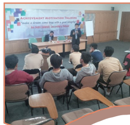
AN NAHL Motivation Training for Grade 9, February 7th, 2016