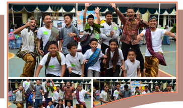
Market Day 2016