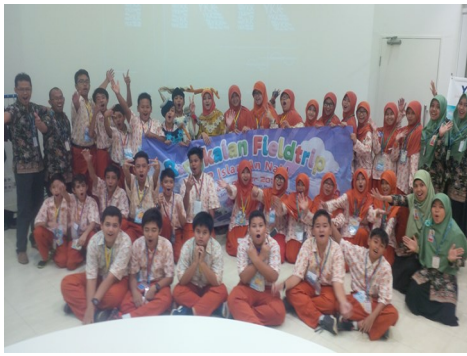
Field Trip ,18 &19 Oktober 2015, Location : YKK Factory