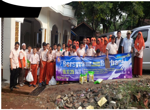
Charity Day, 17 November 2015, location : Kampung Ciangsana