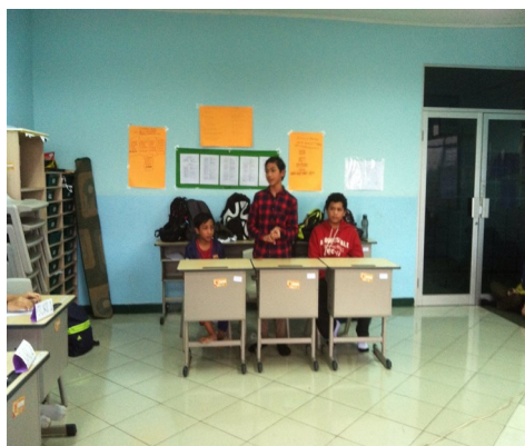
Debate Contest, Secondary Class Competition