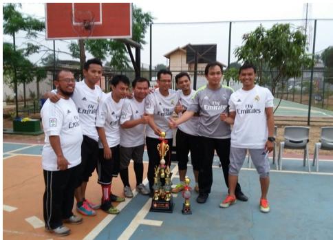
The 1st winner ,secondary Futsal Team, AN NAHL Futsal League