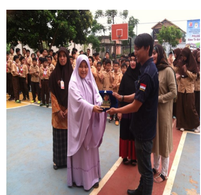
Police goes to school , PSC ( parent Support Club )