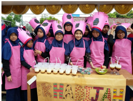
AMC ( AN NAHL Master Chef ) 2016