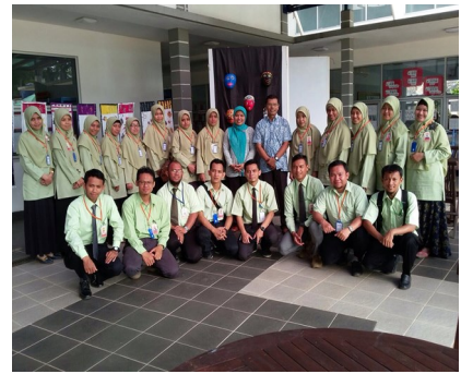
School Visit, Tarasalvia Tangerang