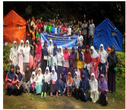
Field Trip ,18 &19 Oktober 2015, Location : YKK Factory