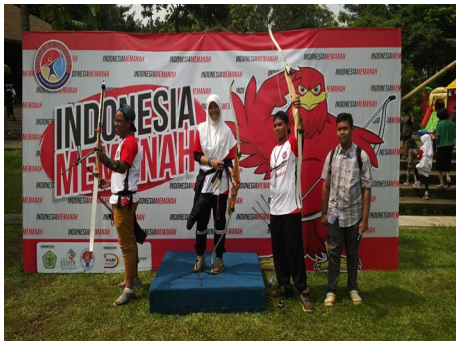
Archery National Competition 2016