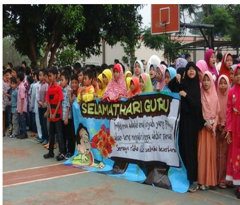
Teacher Day 2016