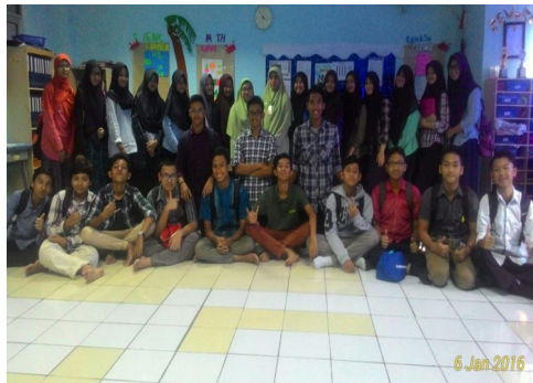
AMT ( Achievement Motivation Training ) Grade 9