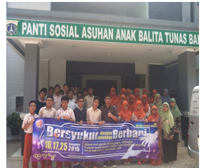
Charity Day, 16 November 2016 Panti Sosial Anak Balita